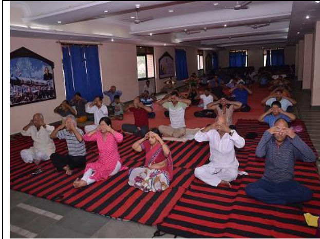
Performing the yoga