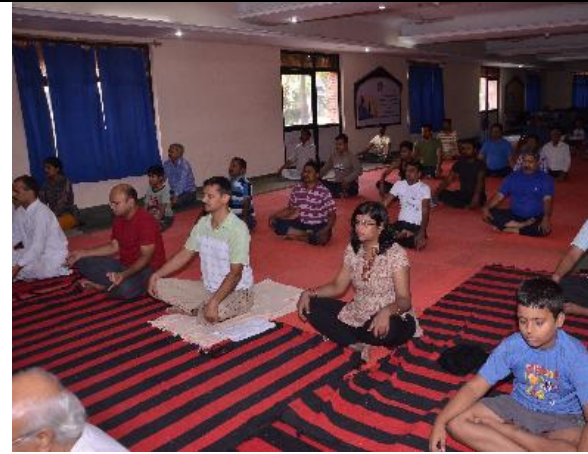
Listening carefully instruction