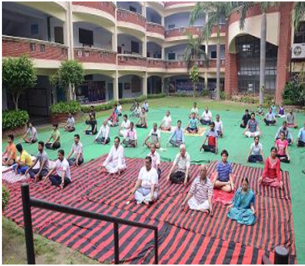
1. Performing yoga

During year 2014-2015 nss team and student take many times participation in villages for the education swach and plantation along with to tell them about the government schemes.