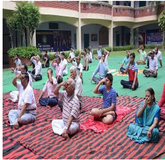
2. All are performing yoga