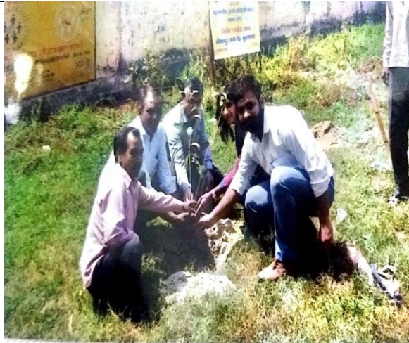
1. Plantation with Gram Pradhan