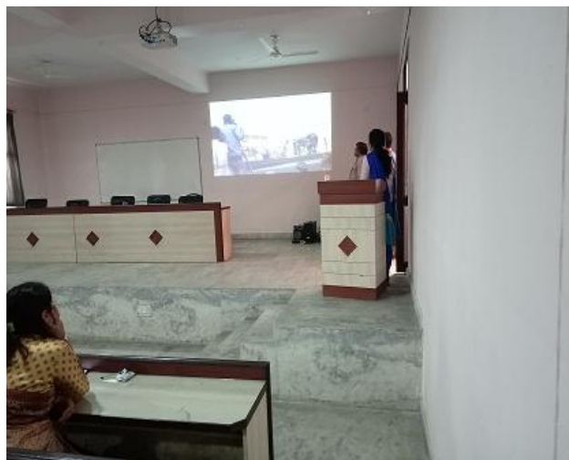
4. Video of Shri Shri is Playing