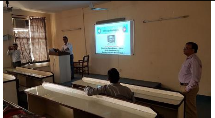
2. Student telling about Sardar Patel