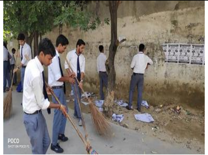
4. Students are cleaning