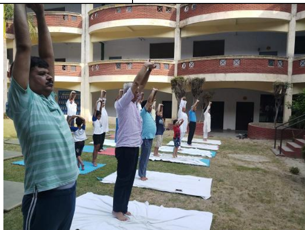
1. Performing the yoga