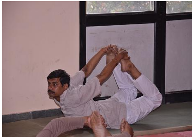
3. Yog Mudra