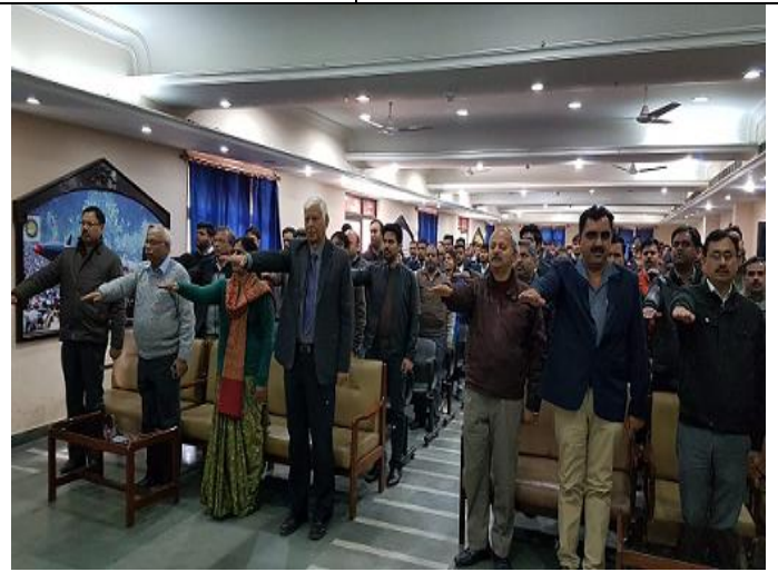
2. Taking Pledge