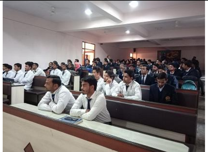
3. Listening instruction carefully