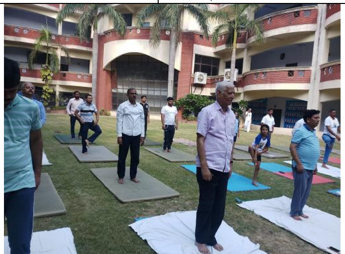
2. Listening instruction carefully