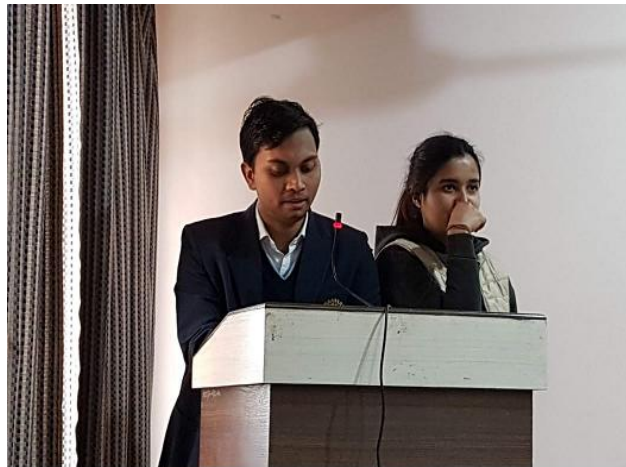
3. Students are giving information