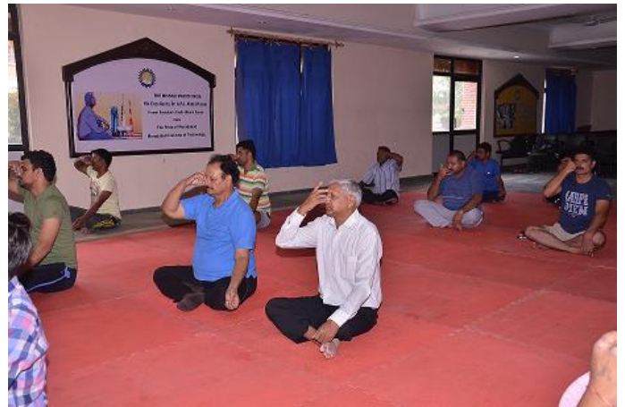
4. Yog Mudra