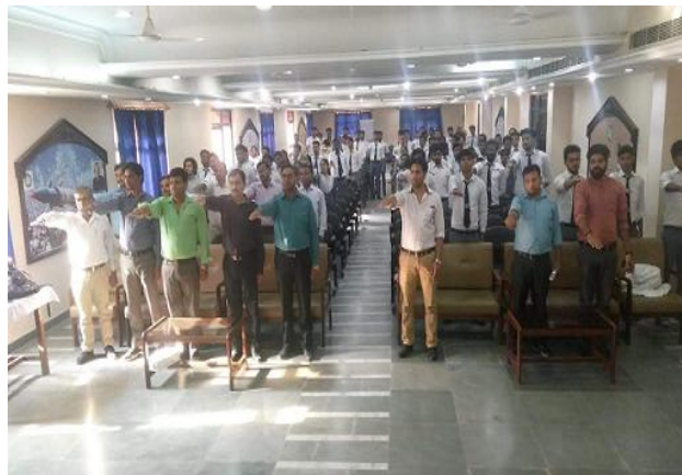
1. Pledge taken by faculty members & Students