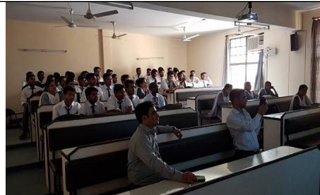
3. Students Listening