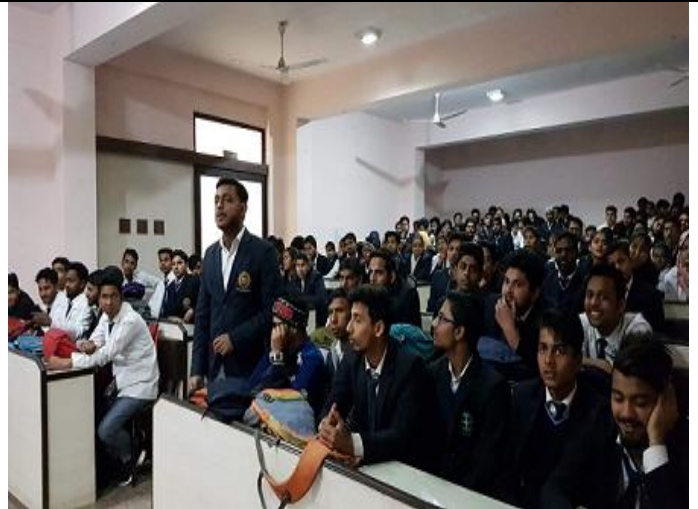
4. Students are answering the questions