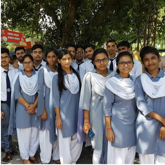
3. Students are enjoying the rally