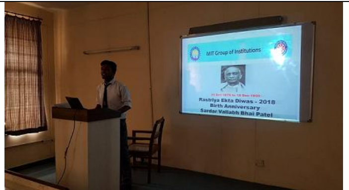
4. Introducing Ekta Diwas