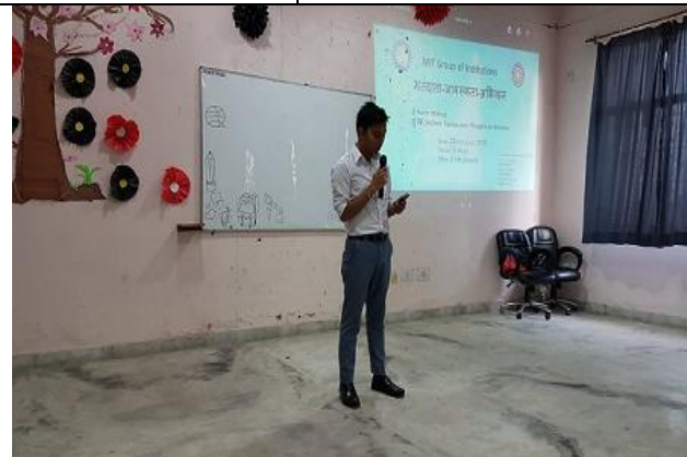
1. Presentation by students