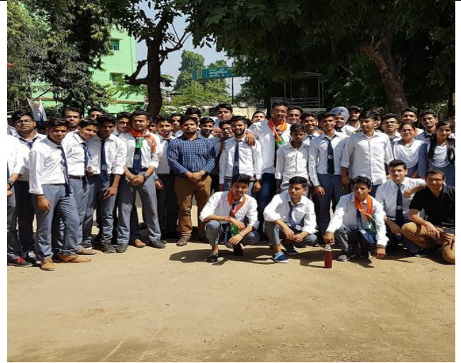
2. Students are grouped after Rally