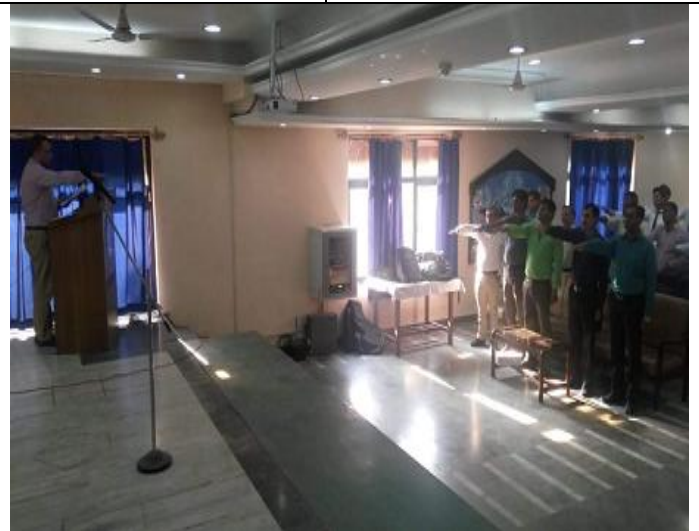
2. Pledge given by NSS convener