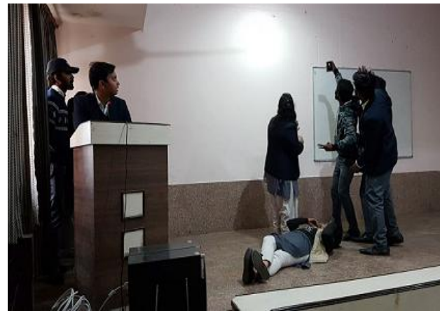
1. Performaing play