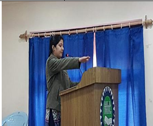
1. Taking Pledge