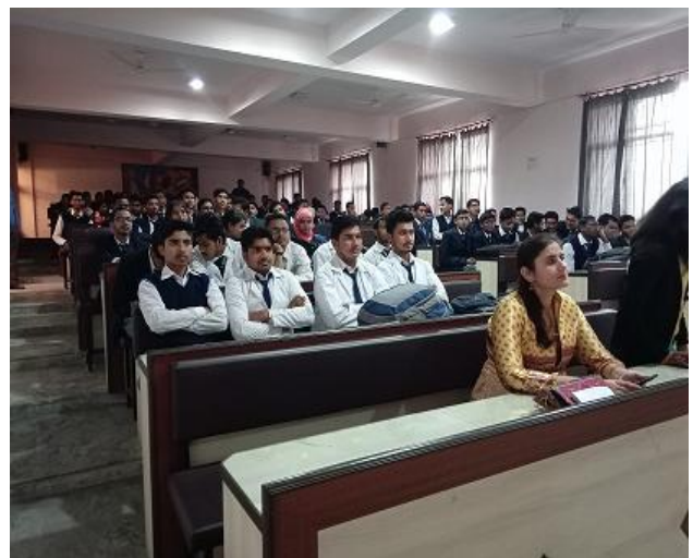
5. Students are watching Video