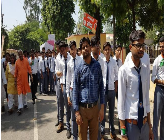
1. Students are in a line for the Rally