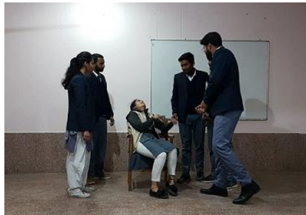
2. Performaing play