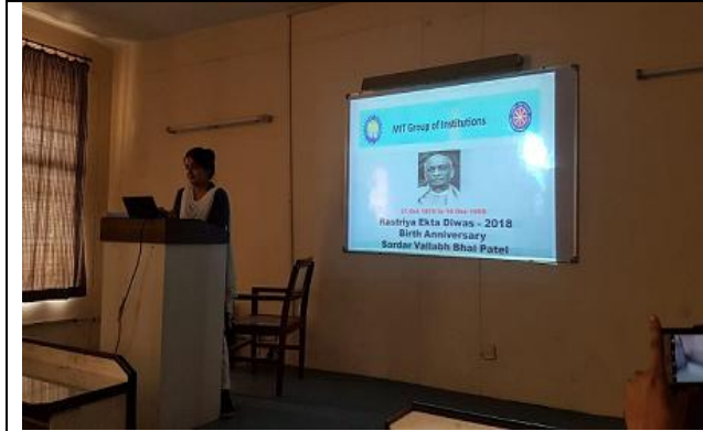
1. Student addressing