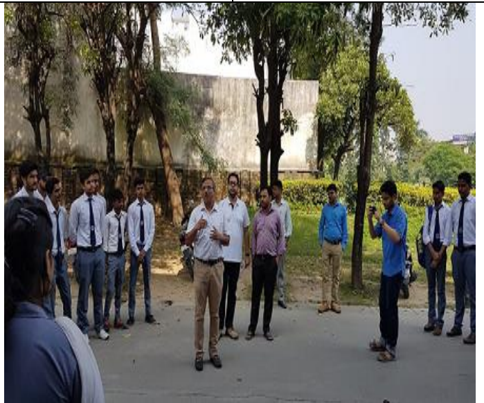
2. Instructions are giving