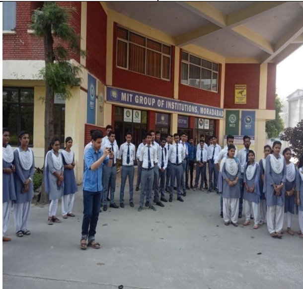
1. Students are gathered for the mission