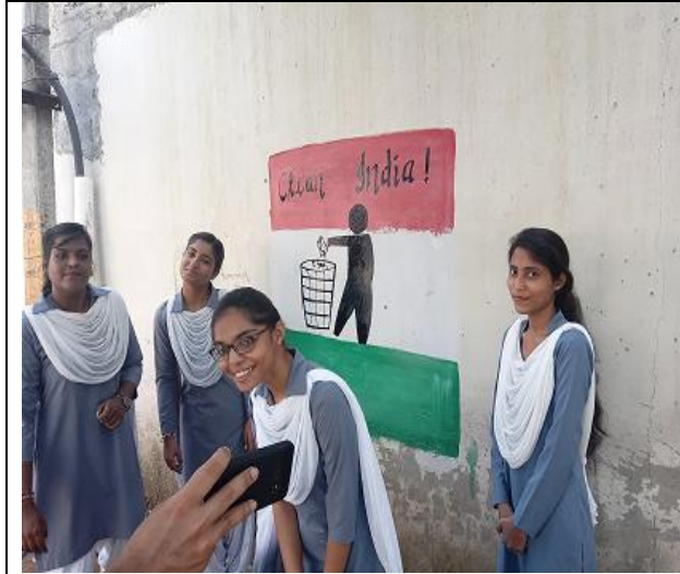
3. Students are making the wall painting