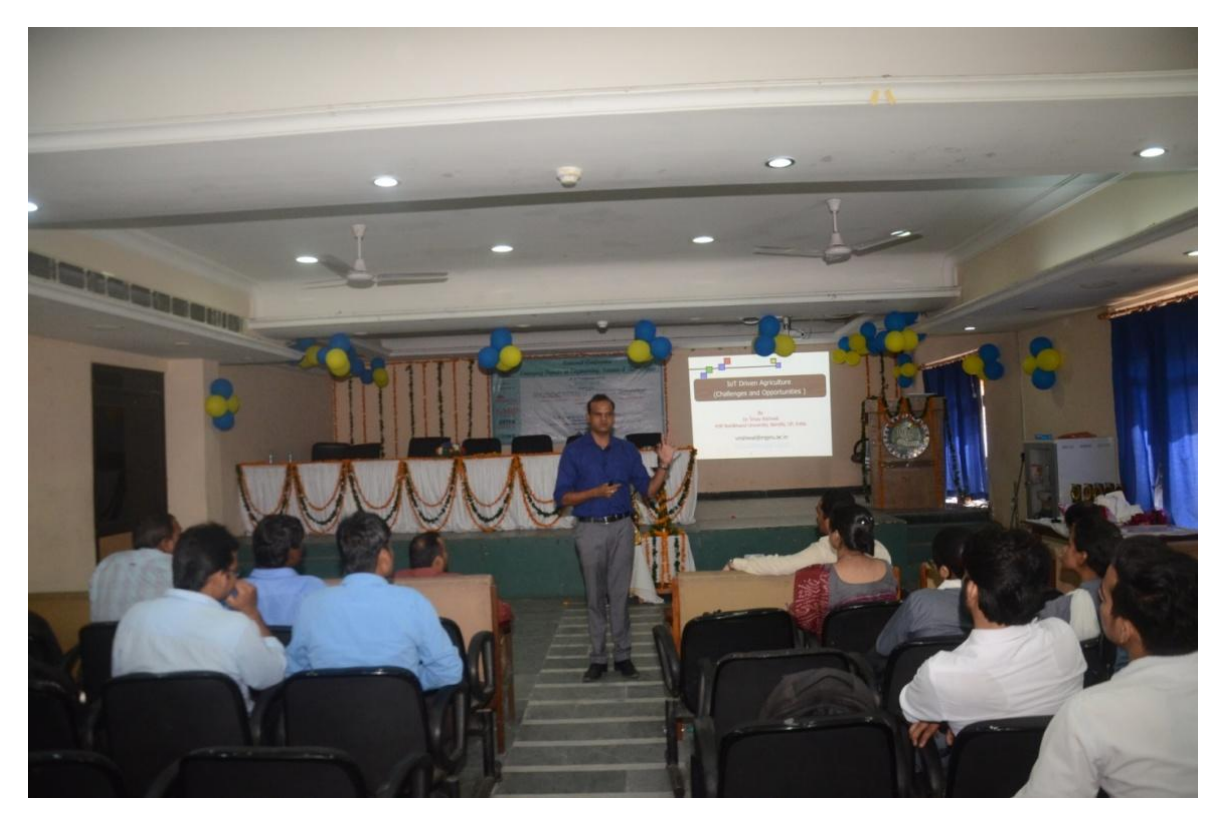
Auditorium (Block D)