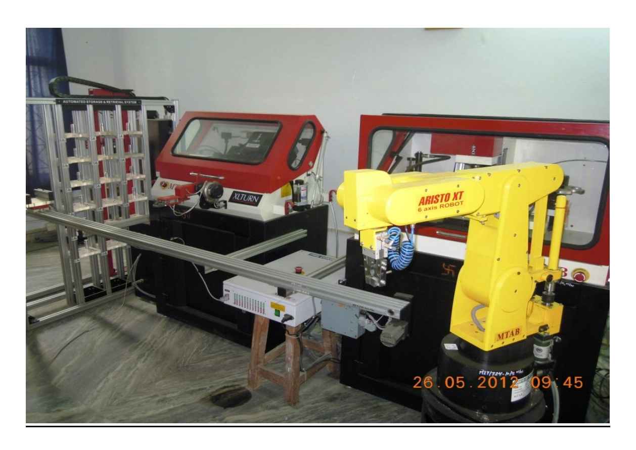
Mechanical Engineering Lab