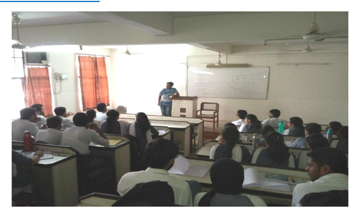
Class Room (Block B)