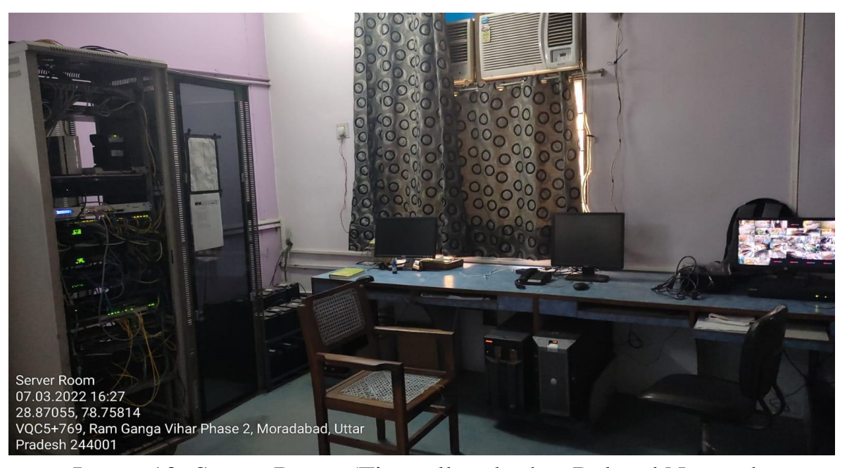
Image 10: Server Room (Firewall and other Related Network Devices)