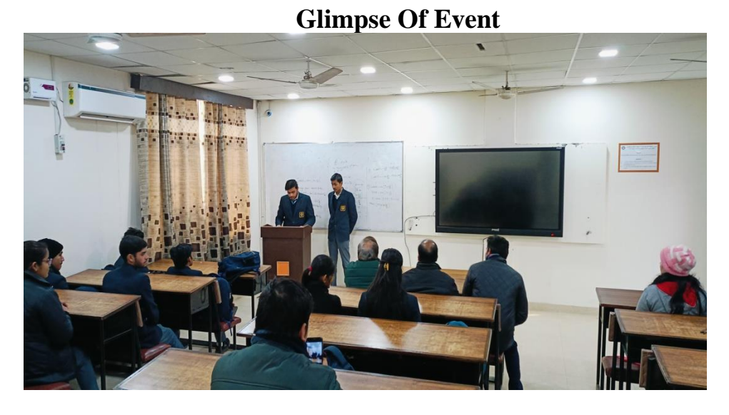
Students Elaborating the brief about Swami Vivekanand

The event was ended with the vote of thanks of all the person who were present there.