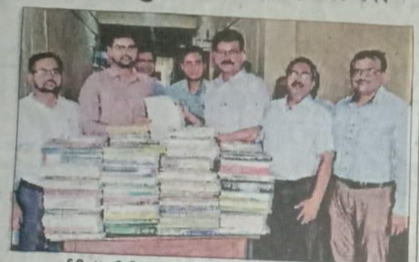
एमआईटी में सीडीओ को पुस्तकें सौंपते पदाधिकारी। विज्ञिप्त

मुरादाबाद। एमआईटी संस्थान ने सरकार की पुस्तक दान योजना के तहत कुल 873 पुस्तकों को सीडीओ को सौंपा। इसका उद्देश्य ग्रामीण इलाकों में पुस्तकालय का निर्माण कर जरूरतमंद छात्रों की सहायता करना है। इन पुस्तकालयों की मदद से ग्रामीण विद्यार्थी पुस्तकालयों का लाभ उठा सकेंगे।