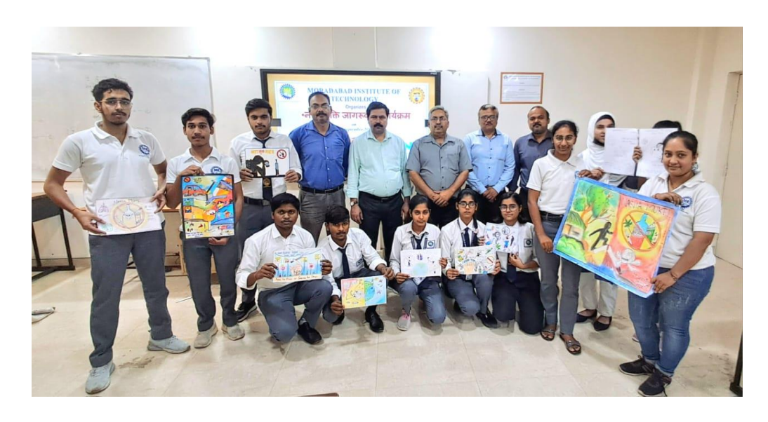
Showing poster made by students